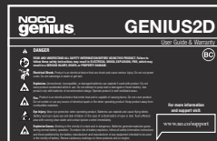
Userguide and warranty